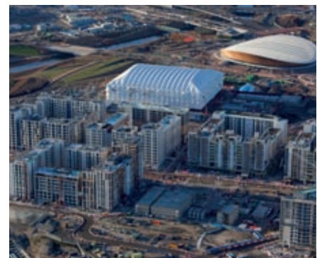
Aerial view of the Athletes' Village

The standard allows for partial certification where only certain elements are covered. This partial basis had been achieved on only a handful of smaller-scale projects in the UK. The Village opted for full certification where all timber elements were covered by the scope of the certification – a first on a project of this scale and magnitude.