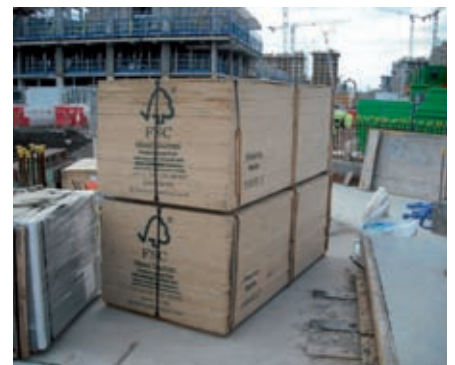
FSC certified timber stock