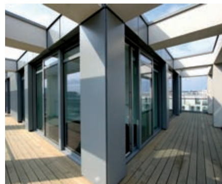
N15 block A balcony showing FSC certified timber flooring