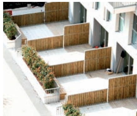
FSC certified timber fencing

One lasting benefit is that several suppliers achieved FSC CoC certification as a direct result of the requirements of this project. This enables the rest of the industry to benefit from improved availability of certified, responsibly sourced timber in the future.