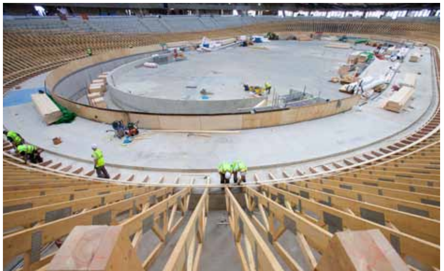
The Velodrome track is made from Siberian pine

The project has increased knowledge and understanding of certified timber across the supply chain. This knowledge has been cascaded through the tiers of contractors and sub-contractors. The suppliers fully understand the certification schemes, the opportunities available and equally, the consequence of non-compliance. A number of suppliers have said that their engagement with the ODA was the first time they had come together to openly discuss the issues of legal and sustainable timber and the supply chain. This open forum needs to continue beyond the Games and should be adopted by a timber industry organisation.