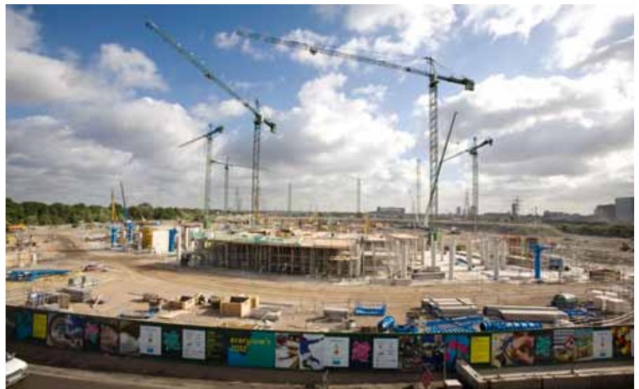
Timber is used in many different forms, including site hoarding

Ultimately the Tier One contractors recognised the benefits of the Timber Supplier Panel.