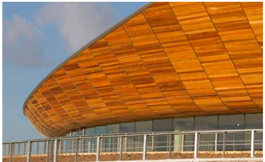
The Velodrome's distinctive cedar cladding